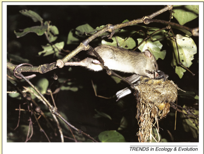
Figure 1. Black rat ( Rattus rattus ) eating a New Zealand fantail ( Rhipidura fuliginosa ) at its nest.

This process provides transparency about the opportunity costs of decisions and the tradeoffs between taking action on different islands. Further real-world complexities can also be addressed within this resource allocation model. These include (i) measuring complementarity between areas when they overlap in species composition; (ii) potential incomplete eradication and the need for additional and/or continuing investment for conservation [40]; (iii) per-unit area differences between islands in the cost of eradication due to habitat, topography and average rat densities; and (iv) interdependencies between costs, values, benefits and probability of success of alternative actions (e.g. fencing and baiting).